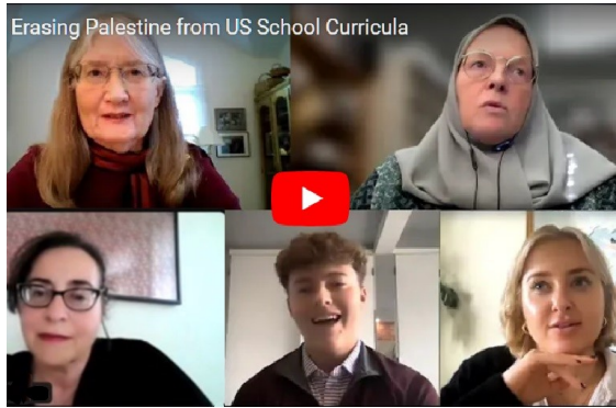
VCHR participated in the VFHL Film Salon: Erasing Palestine from U.S. School Curricula .

On September 10, 2023, VCHR's presentation "The Fight against Israeli Propaganda in Virginia Textbooks" was featured in a Voices from the Holy Land Film Salon titled "Erasing Palestine from U.S. School Curricula."