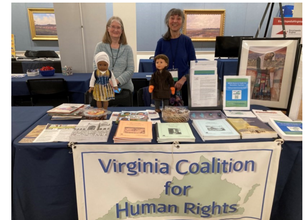
The VCHR Education Committee exhibits at the 2023 VCSS Conference in Richmond.

VCHR's Education Committee participates in webinars, conferences, film salons, as well as history textbook and history standards of learning (SOL) review cycles–in addition to offering teaching materials on the modern Middle East that are accurate and nonbiased.