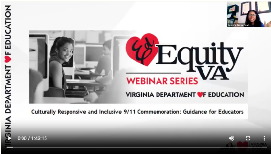
Culturally Responsive and Inclusive 9/11 Commemoration: Guidance for Educators, VDOE's Ed Equity VA Webinar Series

The VCHR Education Resources webpage provides access to the following: